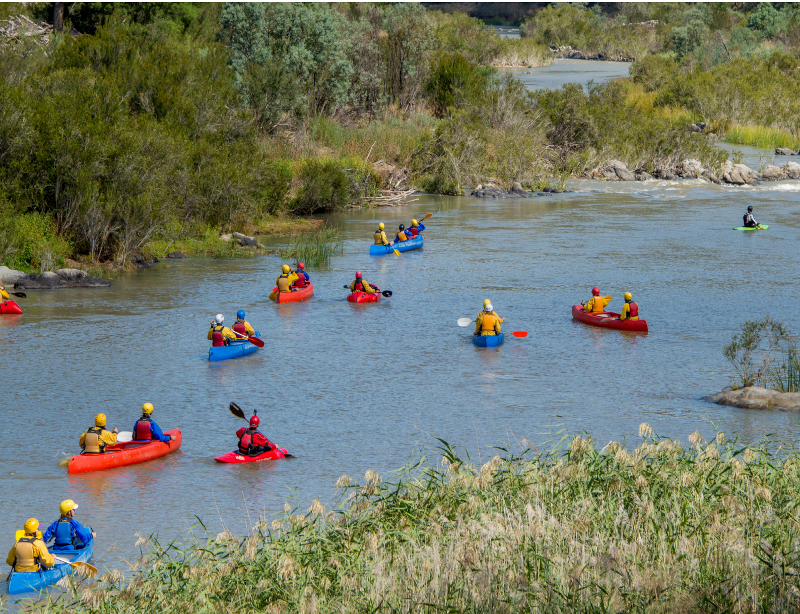
Photograph - Kosciuszko National Park