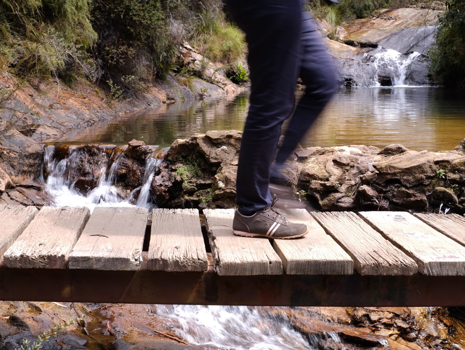
Photograph - Wentworth Falls - Stephen Townsend