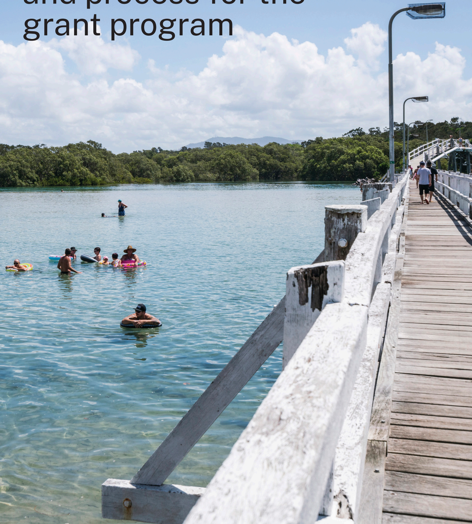
Photograph - South West Rocks - Jaime Plaza van Roon