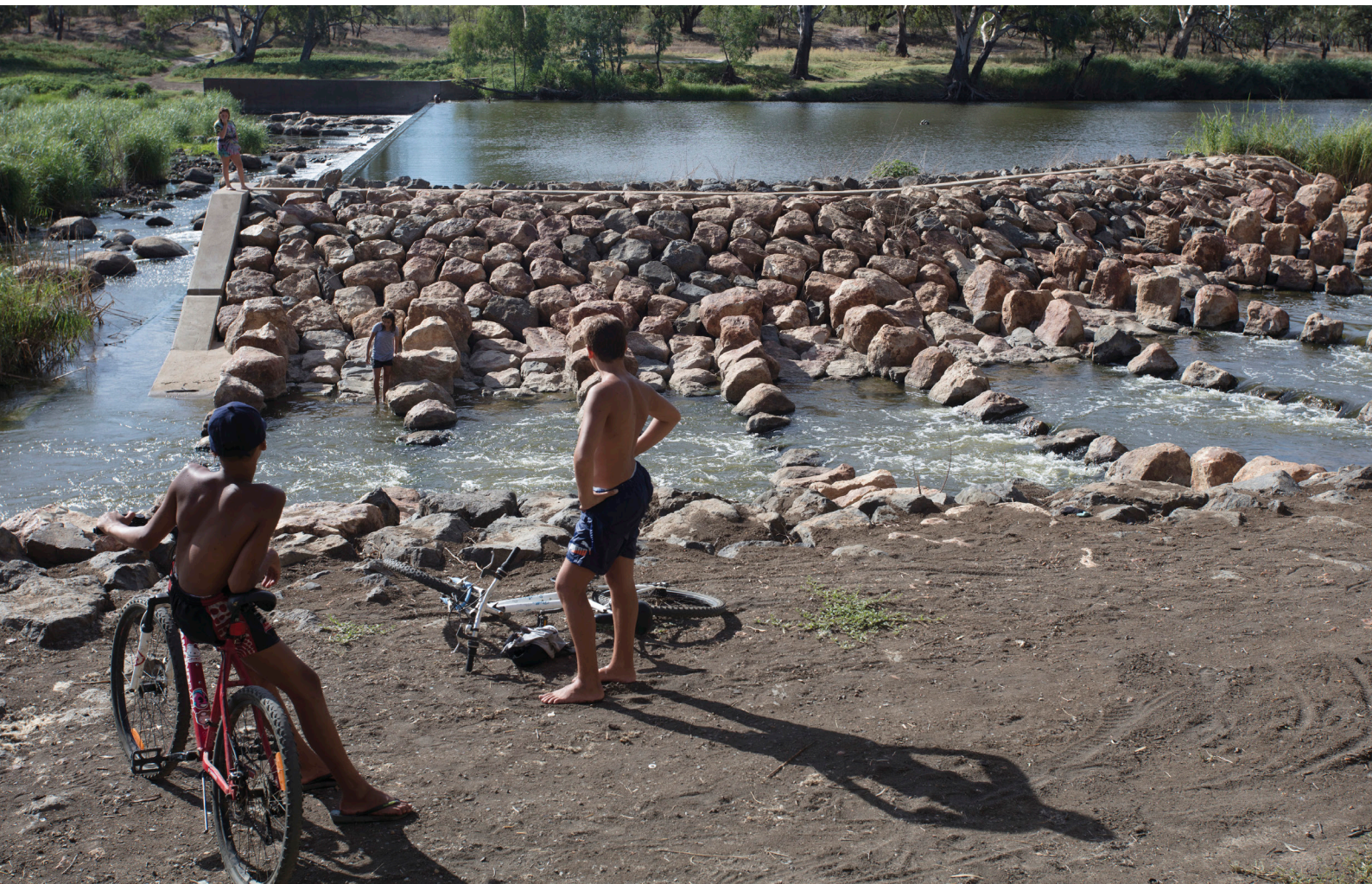
Photograph - Barwon River - Quentin Jones

The latest round of grants now invites all councils in NSW to apply for funding.