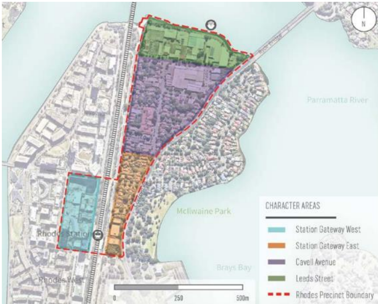
Figure 2: Character Areas

Factors leading to this decision to apply dwelling caps include: