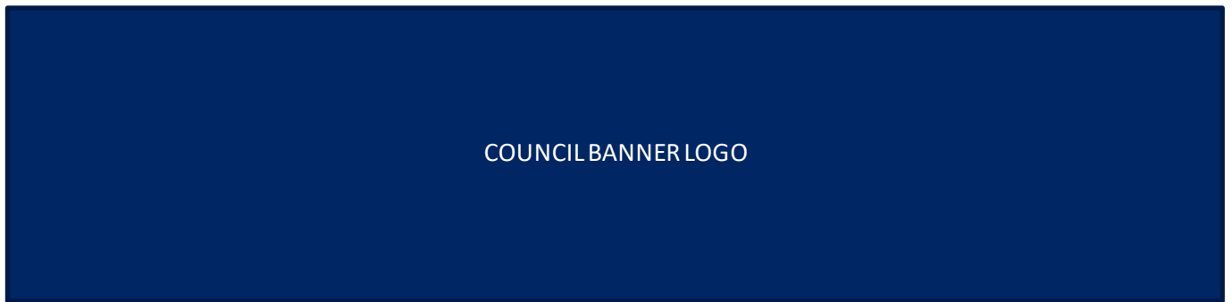
Figure 2. Actual size allocated for council banner logo

The logo should be sent to eplanning.support@planning.nsw.gov.au before council has access to the updated features in the portal