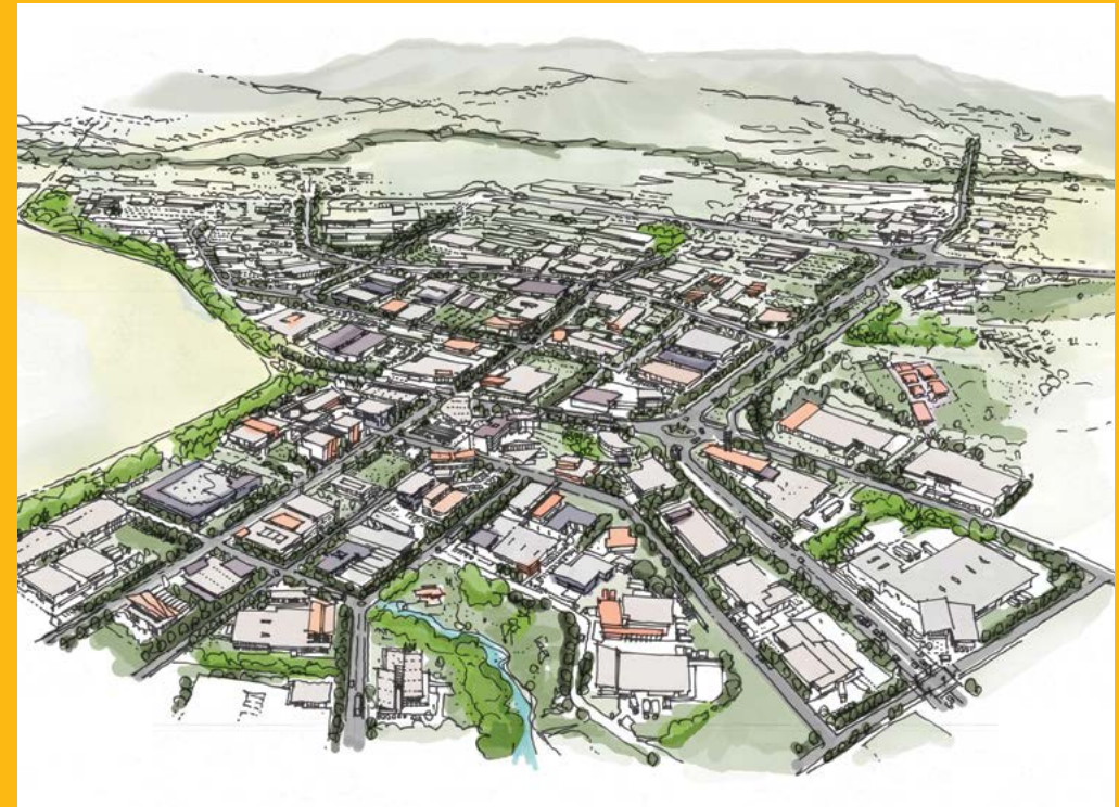
Artist's impression of a proposed specialised centre in the Western Sydney Employment Area

Western Sydney's population is expected to grow by 900,000 TATT