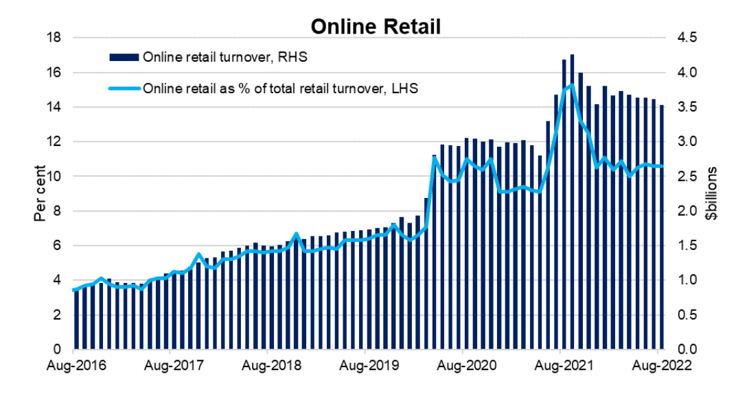
Figure 3. Volume of online retail

Prior to COVID-19, bricks and mortar retailers were facing challenges from long-term structural shifts such as the rise of online retailing and changes in consumer spending patterns from 'goods' towards 'services. These shifts have resulted in increasing vacancies and declining rents over time, putting downward pressure on retail property valuations. The COVID-19 restrictions have put further pressure on vacancies, rents and valuations. While these temporary headwinds are now easing following the end of restrictions, the long-term structural shifts are expected to continue. Online retailing, as a percentage of total retailing, has now stabilised around 11 per cent, a level much higher than the pre-pandemic average of 6 per cent.