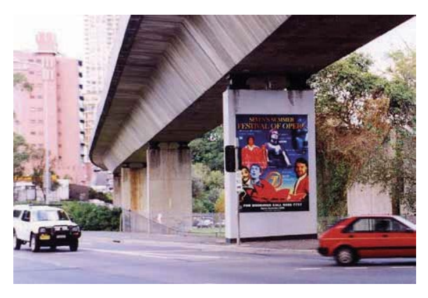
ADVERTISEMENT WITHIN STRUCTURAL BOUNDARIES OF RAIL BRIDGE