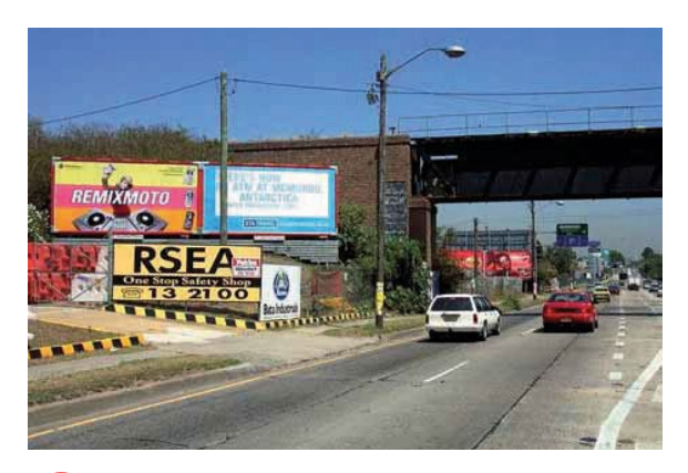
TOO MANY BILLBOARDS ON A SINGLE SITE. OPTION TO CONSOLIDATE SIGNS INTO SINGLE SUPERSITE