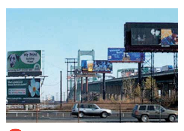
EXAMPLE OF ADVERTISING CLUTTER SEEN OVERSEAS