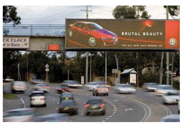
PROTRUDES ABOVE THE TOP OF THE ROAD BRIDGE; NOT IN KEEPING WITH BRIDGE ARCHITECTURE