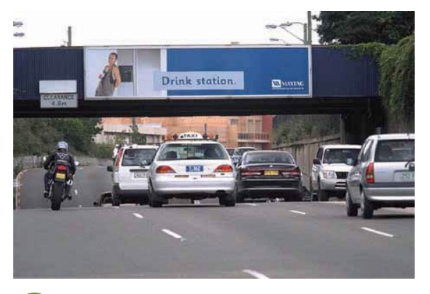
MEETS CRITERA FOR RAIL BRIDGES; IN KEEPING WITH BRIDGE ARCHITECTURE