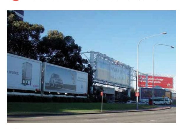
CLUTTER – TOO MANY SIGNS IN A VISIBLE SEQUENCE ALONG A ROAD.