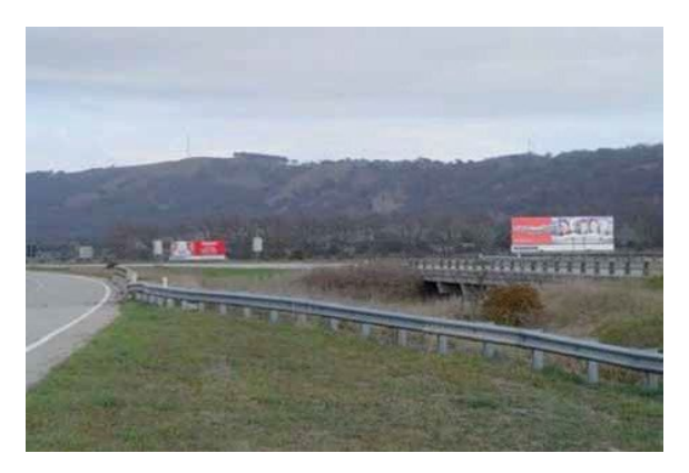
IN RURAL AREAS NO MORE THAN ONE ADVERTISING STRUCTURE SHOULD BE VISIBLE