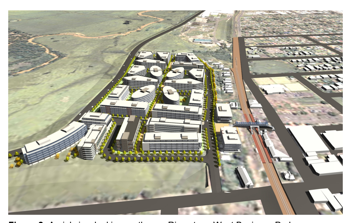
Figure 2: Aerial view looking north over Riverstone West Business Park

In response the submissions regarding the visual impact of the proposed filling works, Jackson Teece prepared a digital 3D model which demonstrates the proposed filled floodplain, the proposed civic plaza and connection to Riverstone Station, and the built form envisaged in the Riverstone West Business Park. Refer to Figures 2, 3, 4 and 5.