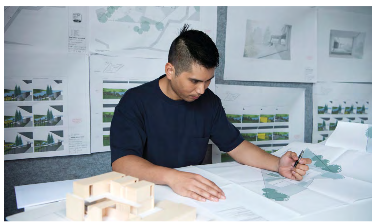
Department of Planning and Environment | Strong Start Cadetship Program Guidelines