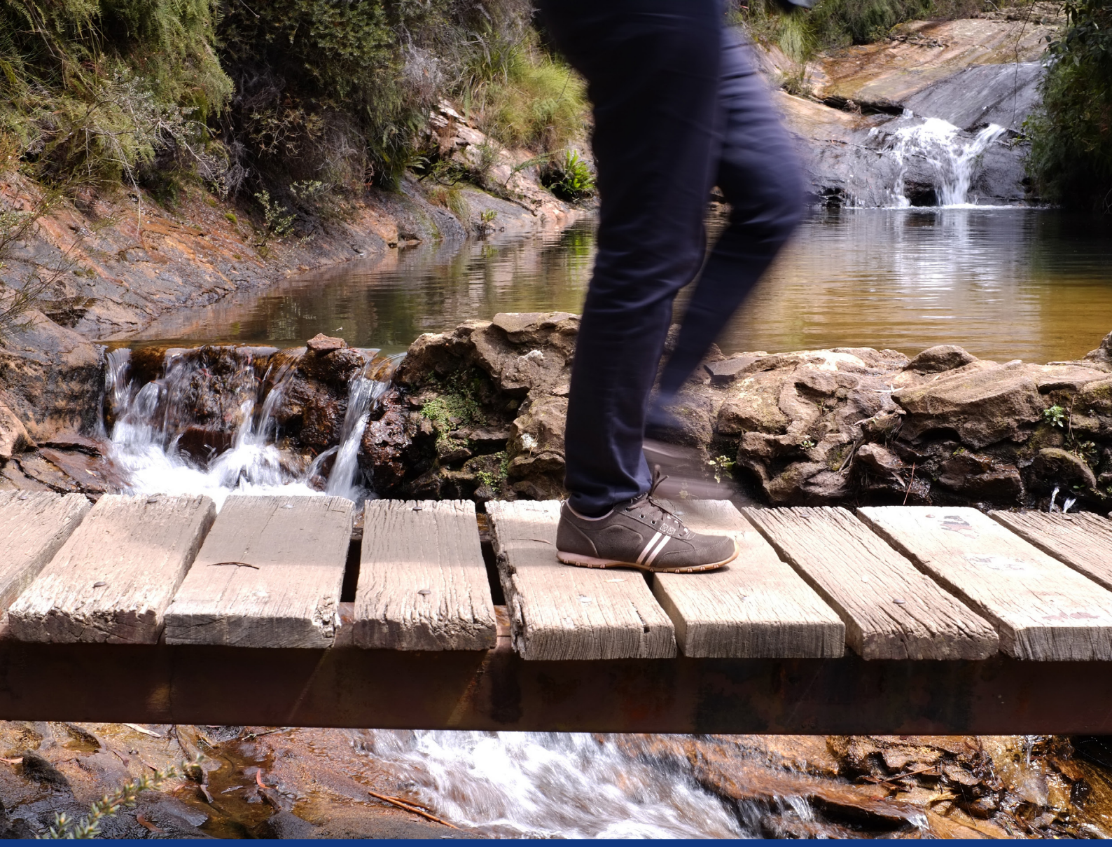
Photograph - Wentworth Falls - Stephen Townsend