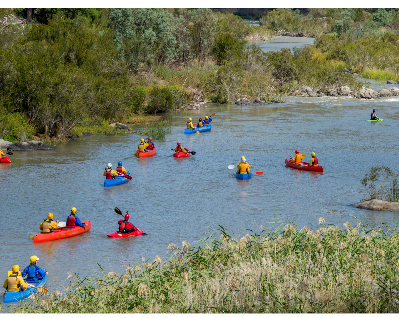
Kosciuszko National Park