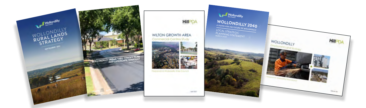
Figure 4: Wollondilly Shire Council local strategies to help deliver the vision of vibrant, sustainable communities in Wilton Growth Area.

Wollondilly Shire Council has taken an active role in preparing the strategic planning policies and framework that will assist in the staged delivery of the Wilton Growth Area.