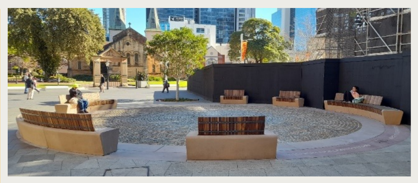
Dharug circle

With 6,000 m<sup>2</sup> of open space, Parramatta Square is comparable in scale to Sydney CBD's Martin Place. It provides the city with a significant new public plaza that is also the civic seat of government for the City of Parramatta local government area.