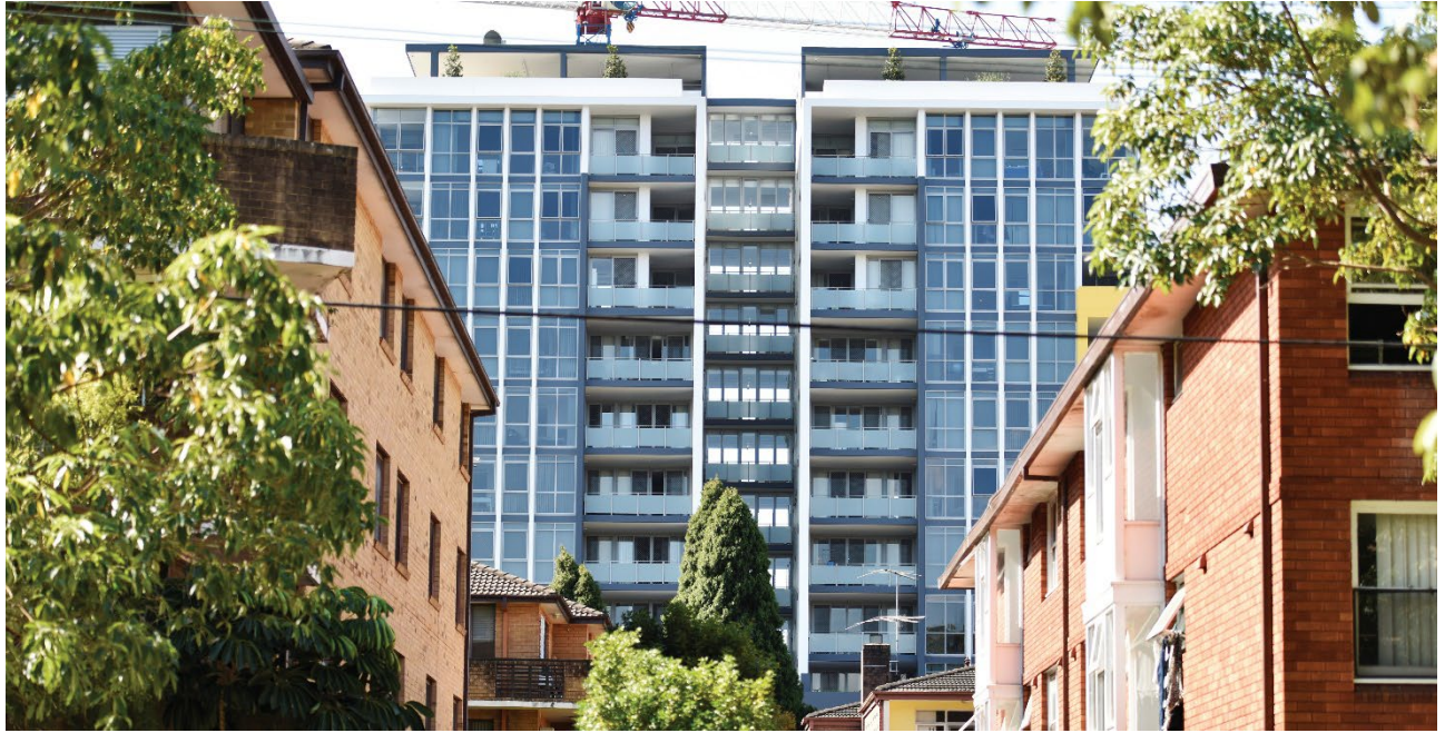
Figure 3. Apartment construction in Strathfield in Sydney's Inner West