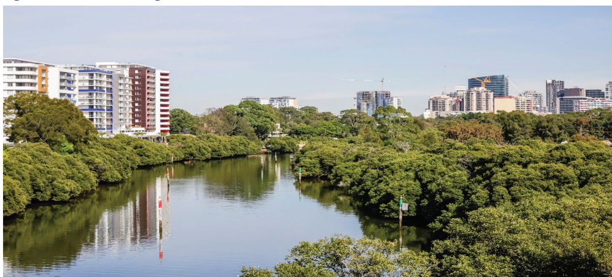
Figure 1. Construction along the Parramatta River from James Ruse Drive, Parramatta, NSW

The 2023 forecast represents housing policy as of December 2023.